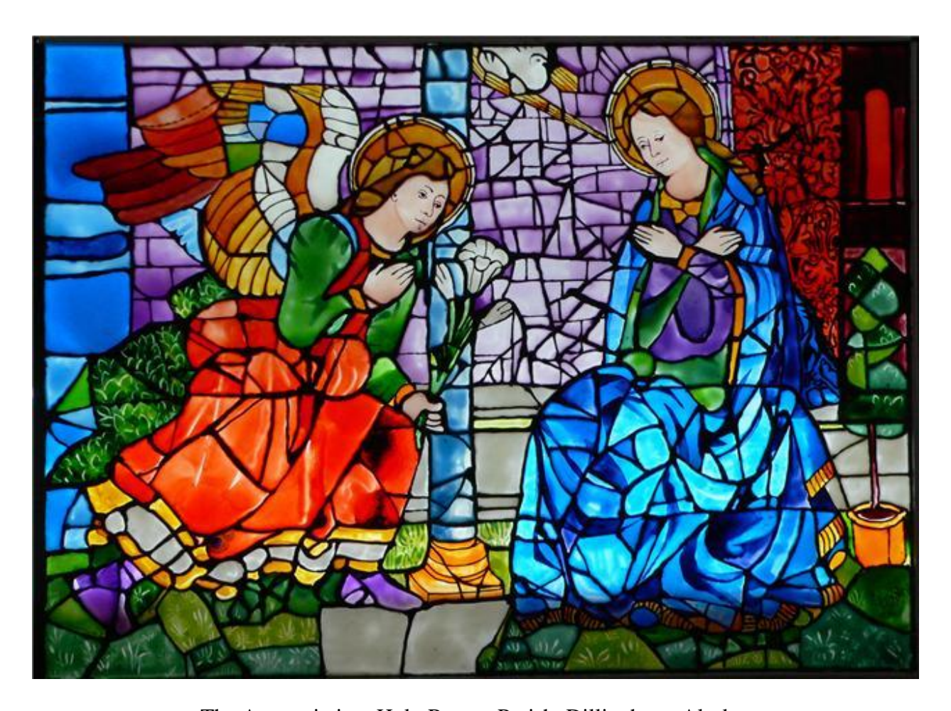
The Annunciation, Holy Rosary Parish, Dillingham, Alaska.