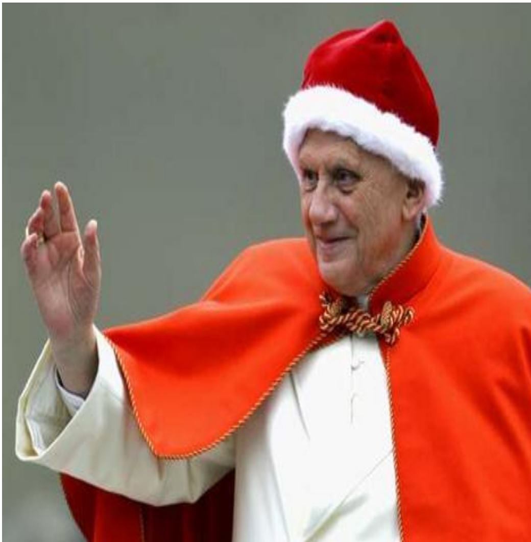
The Pope's Christmas Hat

The Pope wearing the camauro , a fur trimmed, red velvet hat that had been worn since the 12th century but hadn't been donned by a pontiff since 1963, and giving his blessing.