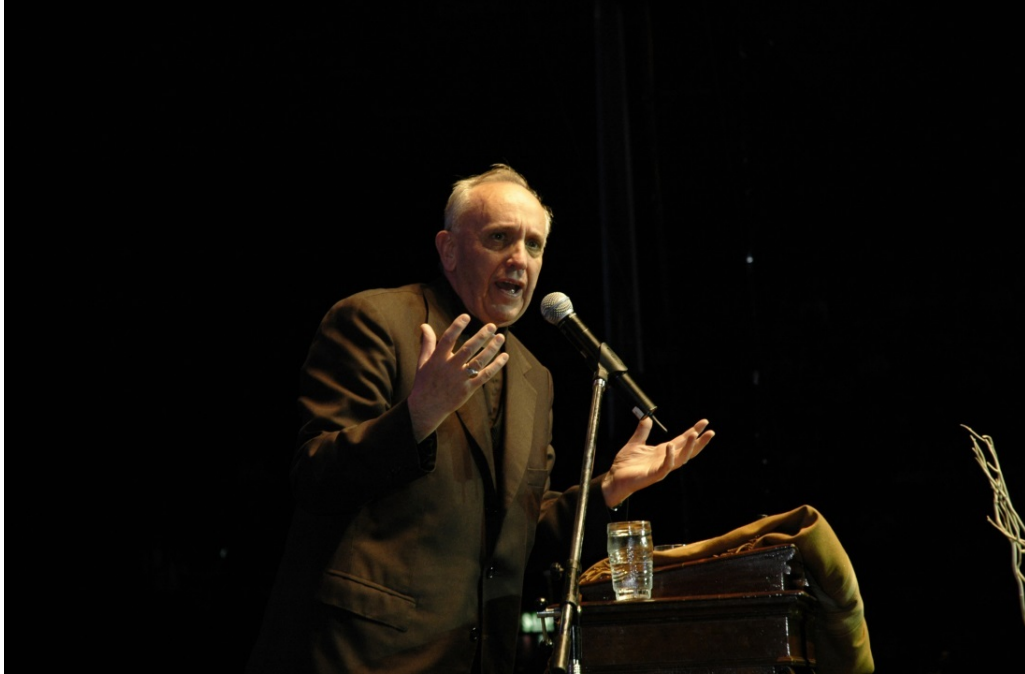
Cardinal Bergoglio preaching at the Conference. You can see his simple attire.