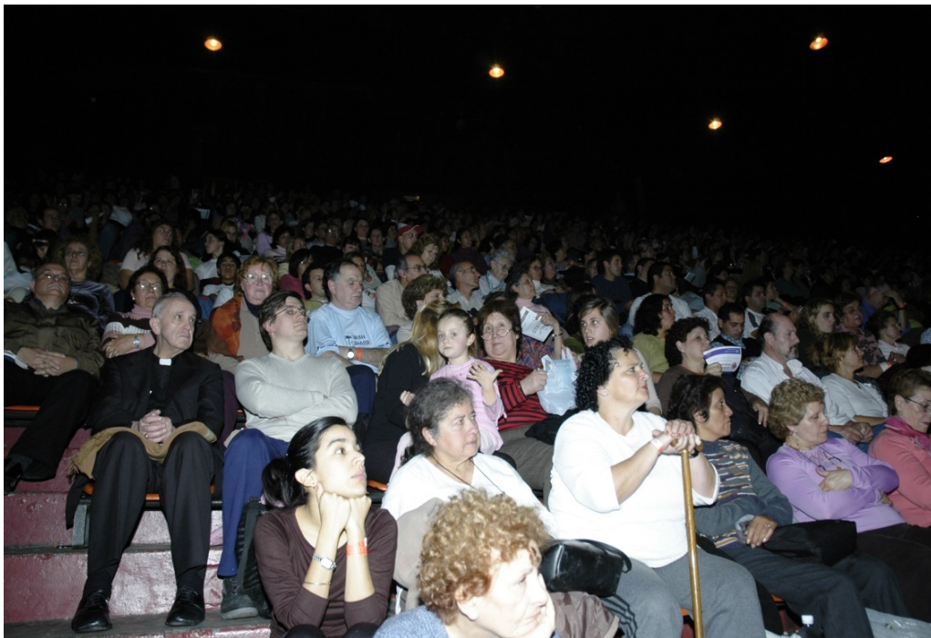
Bergoglio sitting in the stands with the regular folks during the conference. He looks like just another priest.