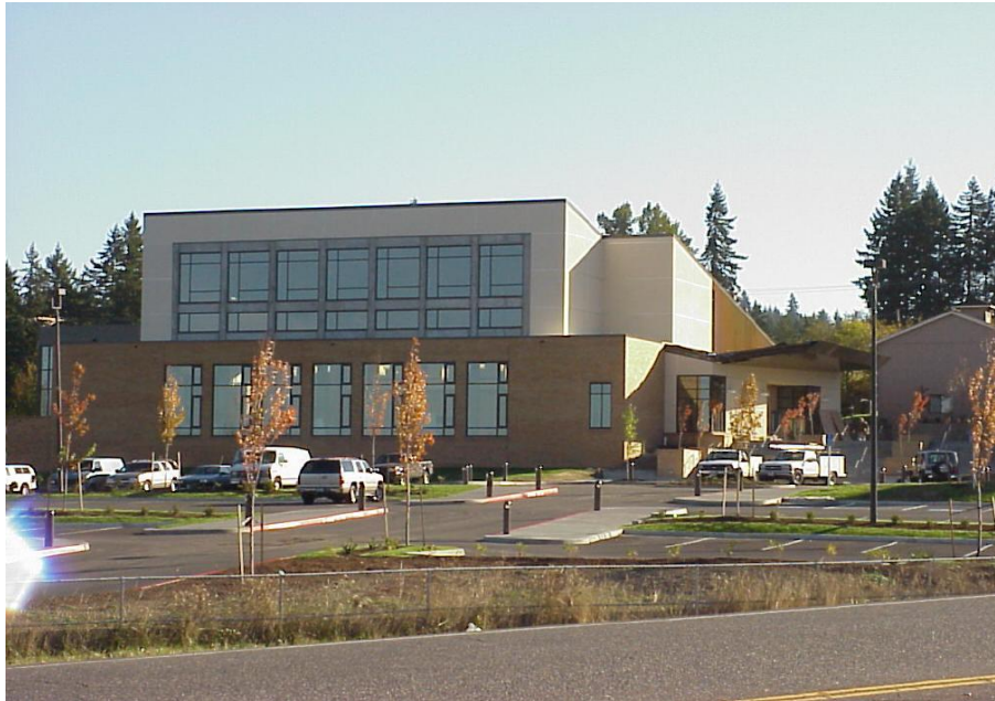
Church of the Resurrection