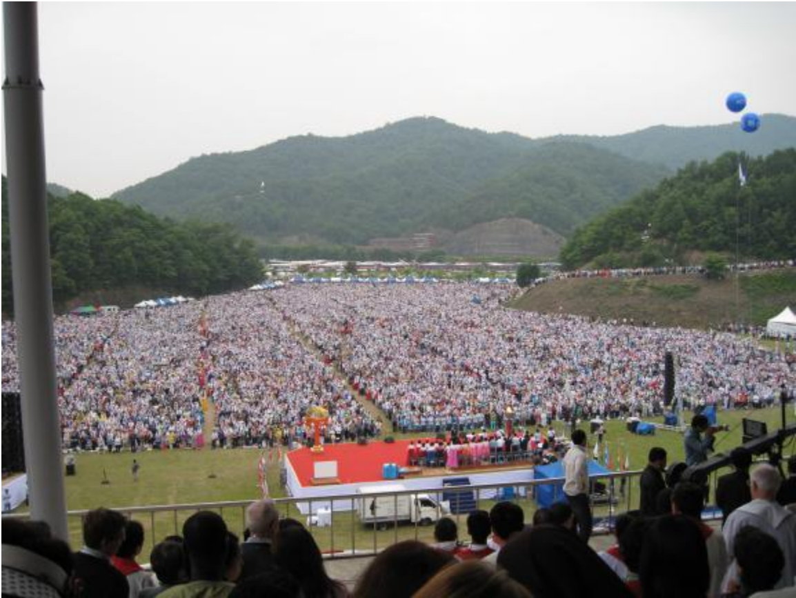
The concluding Mass