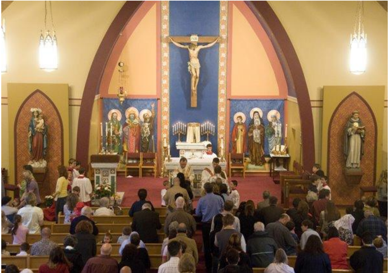
St Thomas Aquinas Church interior