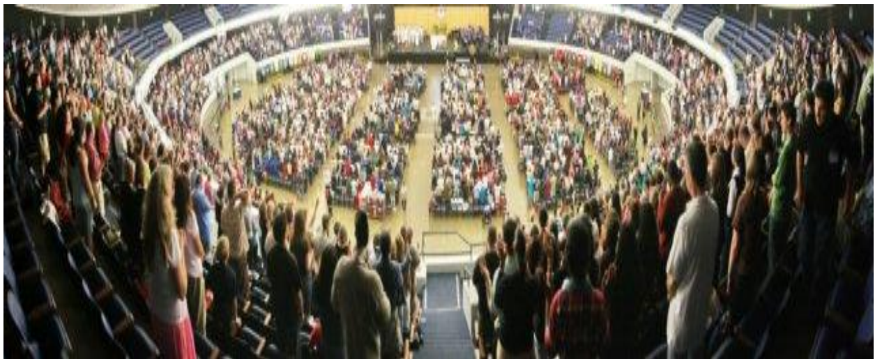
2009 SCRC Catholic Charismatic Renewal Convention, California

Praise God for the wonderful wisdom and conviction of the Holy Spirit in our lives! We are called to live the Gospel and we are empowered to do so by the gift of the Holy Spirit. May we come to love and serve as Christ does more and more through this Lent.