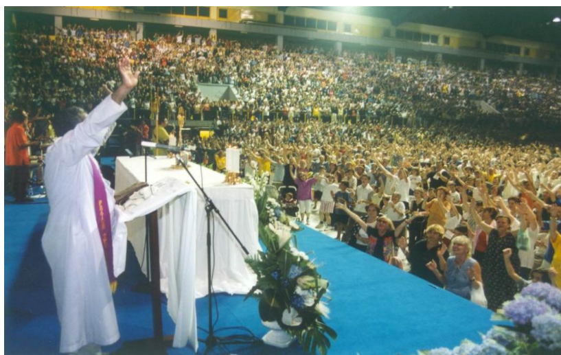
Mass at the Divine Retreat Center